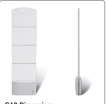
G10 Dimensions HEIGHT : 1.65 METERS / 5.413 FEET 0.49 METERS / 1.607 FEET WIDTH : 0.11 METERS / 0.360 FEET DEPTH :